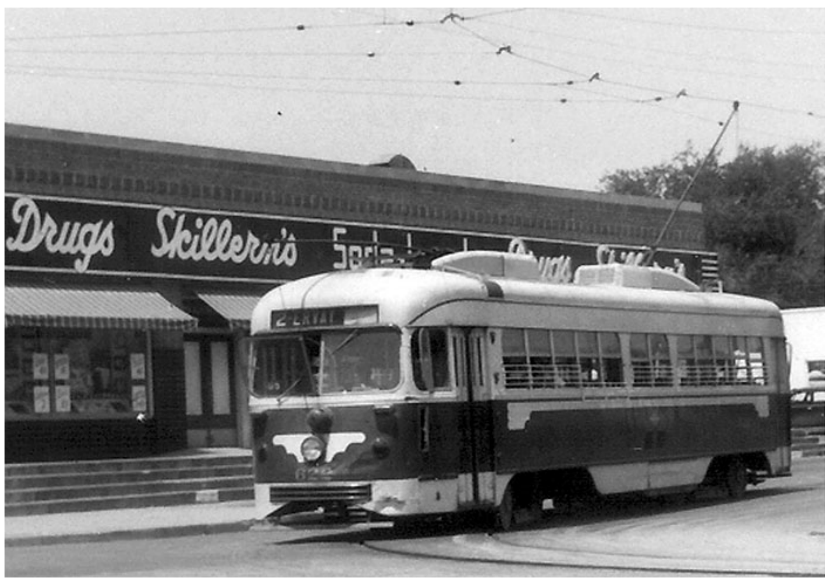
Skillern's drugstore was on the southwest corner of Davis and Edgefield. Streetcar headed back to downtown, turning onto 7<sup>th</sup> Street.

Until it was dismantled in the mid-1950s, an electric streetcar line ran into the William Myers Section . From what is now known as the Bishop Arts District this light commuter rail ran west along 7<sup>th</sup> Street, turning north on Edgefield Avenue. It deadended just before Edgefield reached Kings Highway. There it stopped; the driver would get out, reset the overhead electric trolleys, and drive the double-ended car back in the opposite direction.