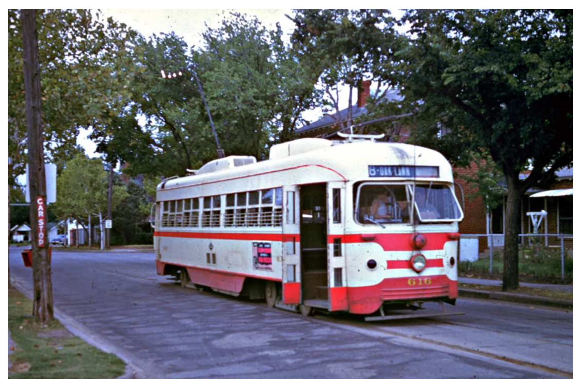
Streetcar again on Edgefield Avenue, at the end of the line. Kings Highway is seen in the distance, at the next intersection. The back corner of a little "7-11" convenience store located on a triangular lot at the corner of Edgefield and Green Street can be seen in the far distance. (Reported date: 1948)